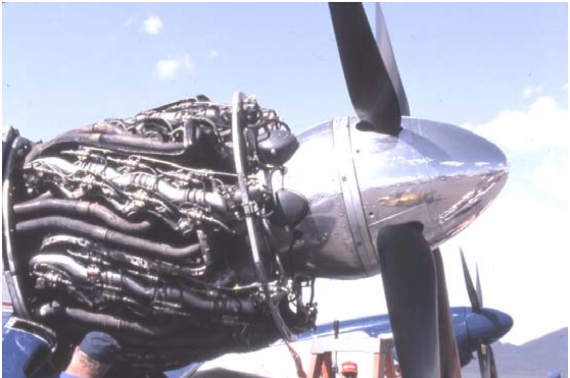
R-4360 Powered Super Corsair